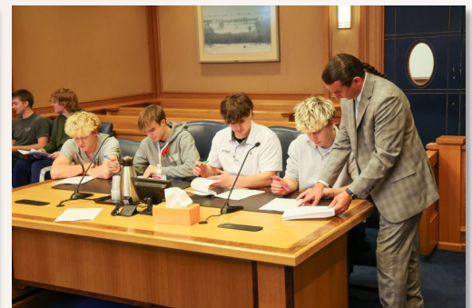
Sioux Falls Christian School Mock Trial at the U.S. Courthouse in Sioux Falls.