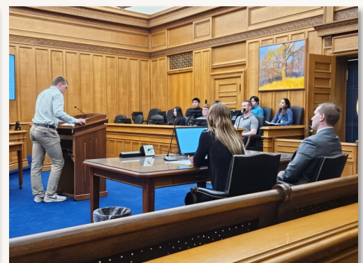
Summit High School Mock Trial at the U.S. Courthouse in Sioux Falls.