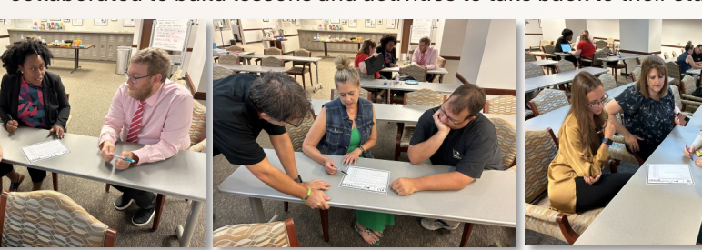
Educators participating in the Summer Teacher Institute in St. Louis, Missouri.

With the guidance of judges and legal experts, they explored the strategy and the cases that paved the way for Brown and its companion cases, analyzed the United States Supreme Court opinion, and applied their hand to modern day equal protection scenarios. Most importantly, they collaborated to build lessons and activities to take back to their students.