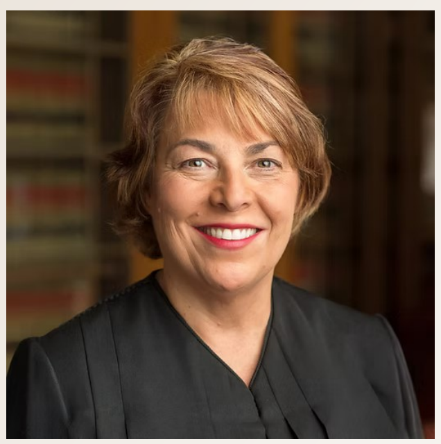
Chief U.S. Magistrate Judge Helen C. Adams.

Chief U.S. Magistrate Judge for the Southern District of Iowa Helen C. Adams presided over a mock trial with the Des Moines Boy Scouts troop on September 30, 2024. The Scouts were working on their law merit badge.