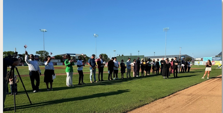
New citizens taking the Oath of Allegiance at the Fargo-Moorhead RedHawks' game.

On August 1, 2024, the District of North Dakota hosted a naturalization ceremony before the Fargo-Moorhead RedHawks' game with 25 individuals being welcomed as new citizens. Eighth Circuit Judge Ralph Erickson threw the ceremonial first pitch of the game.