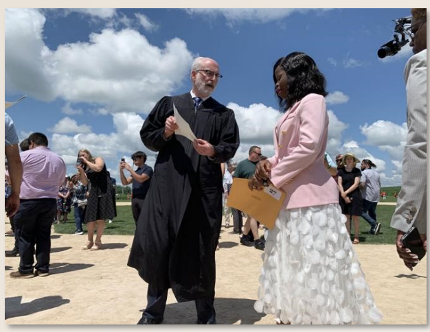
U.S. Magistrate Judge Mark Roberts congratulating one of 35 new citizens at the naturalization ceremony at the Field of Dreams.

On July 6, 2024, 35 new citizens from 15 different countries were welcomed during a naturalization ceremony at the iconic Field of Dreams in Dyersville, Iowa.