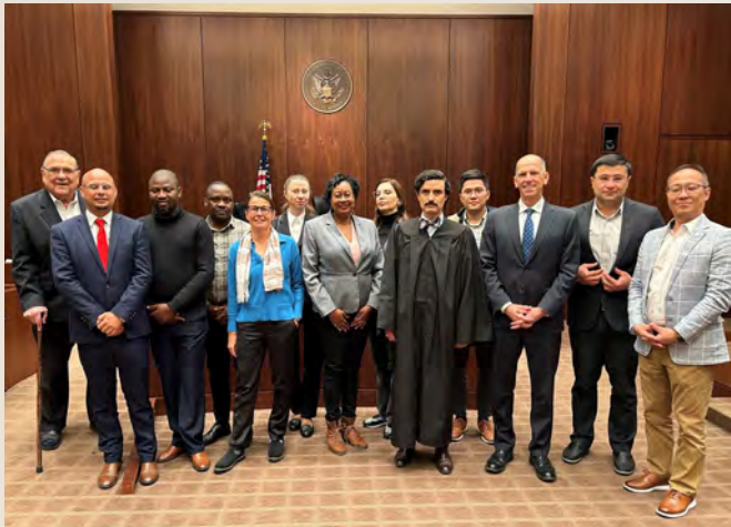
International judges and civil servants from the State Department program.