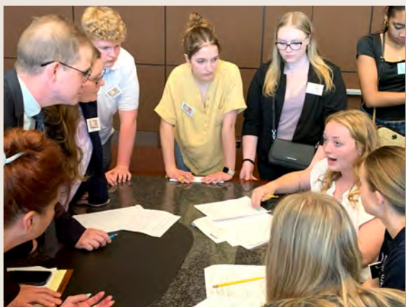
Students working on moot court activity.