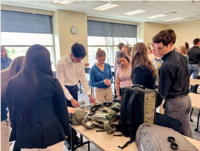
Students get a close up look at United States Marshals gear.

The Northern District of Iowa hosted 37 students from Kirkwood Community College's Workplace Learning Connection on April 25, 2024, at the Cedar Rapids, Iowa, courthouse. In addition to getting to see United States Marshals gear up close and visiting a courtroom, students also met and talked with representatives from various court departments including: United States Marshals Office, United States Attorneys Office, Federal Public Defenders Office, legal assistants, paralegals, jury administrators, courtroom technology technicians, and United States Courts librarians.