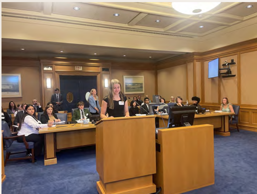
Students participating in mock trial experience at the Sioux Falls courthouse.