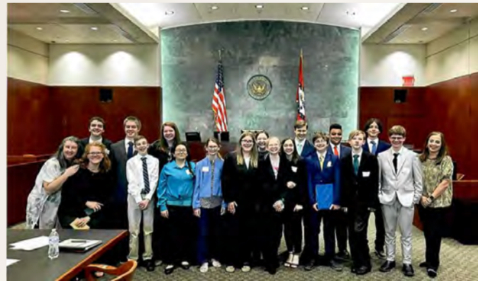
Students who participated in the mock trial contest.

The Classical Conversations Challenge B Homeschool Mock Jury Trial Contest was held in the G. Thomas Eisele Ceremonial Courtroom. Students were able to experience firsthand how a trial works and engage with members of the judiciary in the process. Finally, multiple University of Arkansas-Little Rock Law School Trial Advocacy classes held their final trials before Eastern District of Arkansas judges.